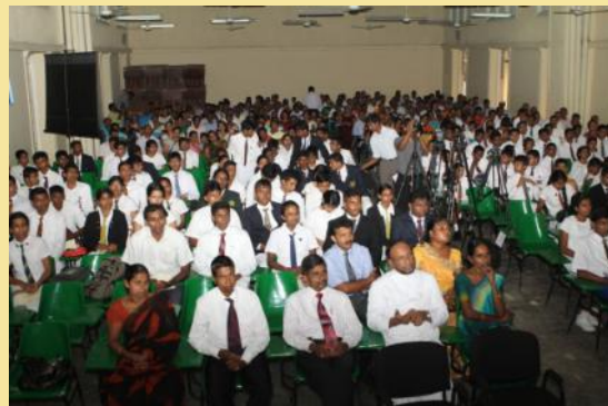
Camera Captures of Award Ceremony– 2012 of the Sri Lankan Olympiad competition