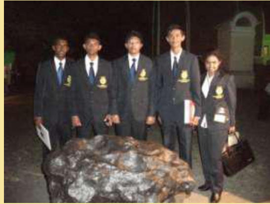
In front of a meteorite (mass is said to be 4200 times that of an official football) at the Brazilian National Observatory